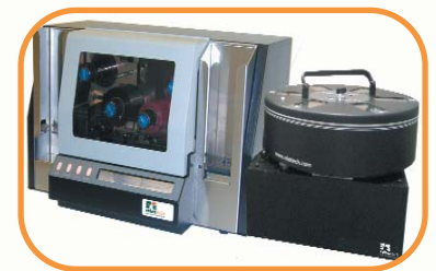
Optional 6-hopper carousel